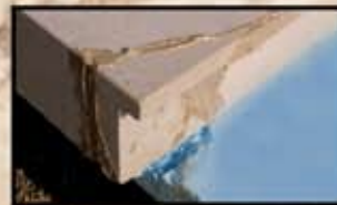
3 Reattaching stone with Extreme™ epoxy