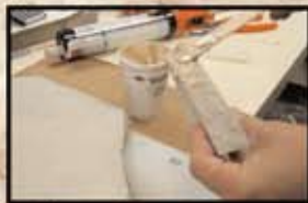
2 Applying epoxy to broken piece