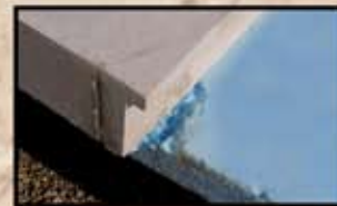
4 After grinding off excess surface epoxy