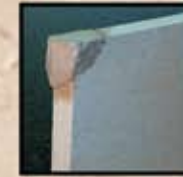
2 Applied Last Patch™ Limestone