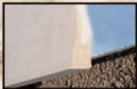
1 Before application