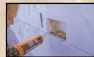
1 Applying Extreme™ epoxy