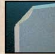
1 Before application