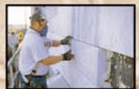
2 Positioning stone