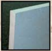
3 After grinding flush